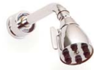
A. & B. Typical installations