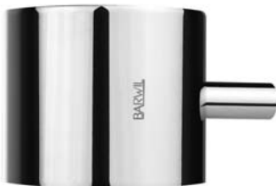
Contemporary Q range