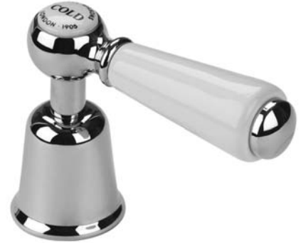
Regent with china lever handles (RFC)