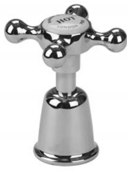
Regent with ceramic disc (RCD)