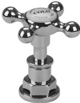
1890's with ceramic disc (GCD)