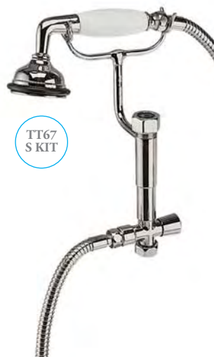
TT67 S KIT